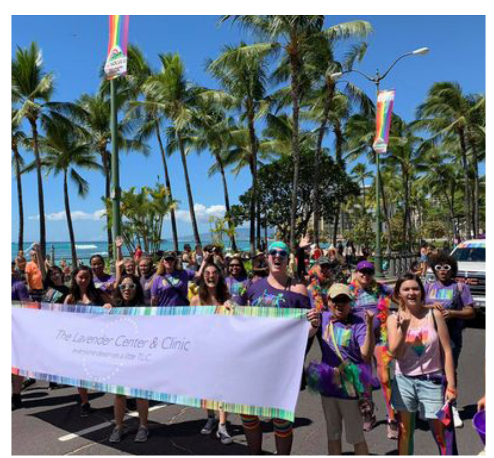
Scene from 2019 Honolulu Pride Parade.

TLC is now offering medically supervised weight management for all patients who are experiencing overweight or obesity and who would like to learn more about the latest medical options for effective treatment. Science shows that decreasing total body weight by even just 5% (10 pounds for a 200-pound person) can make a big difference in improving weightrelated health problems and quality of life. It's a complex problem that requires a multifaceted approach and long-term help from trained, compassionate healthcare professionals. Please schedule a medical visit with Dr. Keith or Dr. Tali to learn more and to find out how we can best support you in achieving and maintaining optimal health, including weight management, over your lifespan.